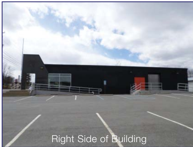
Right Side of Building