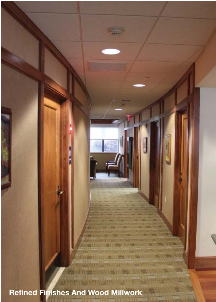
Refined Finishes And Wood Millwork