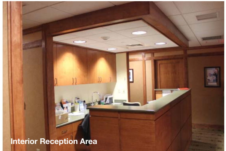
Interior Reception Area