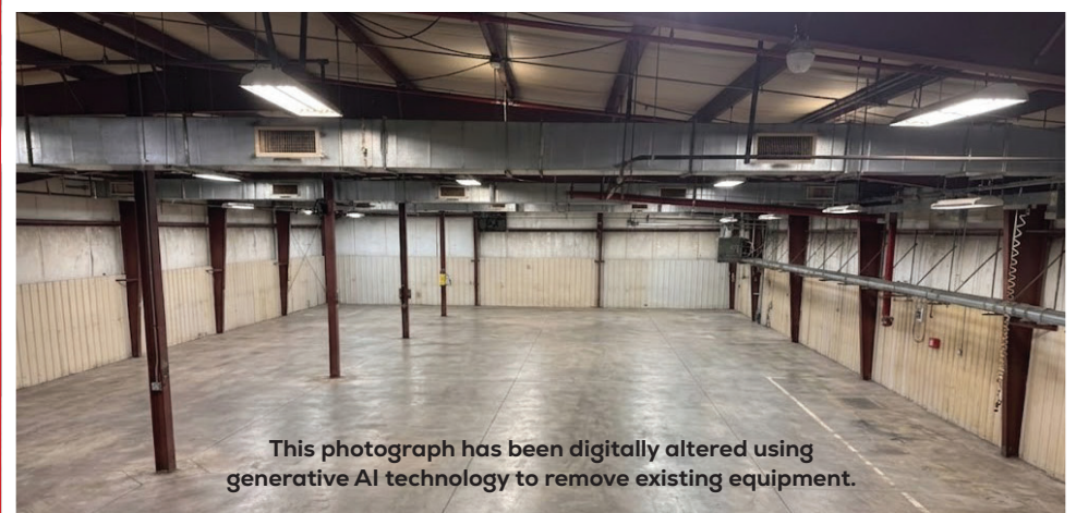
This photograph has been digitally altered using generative AI technology to remove existing equipment.