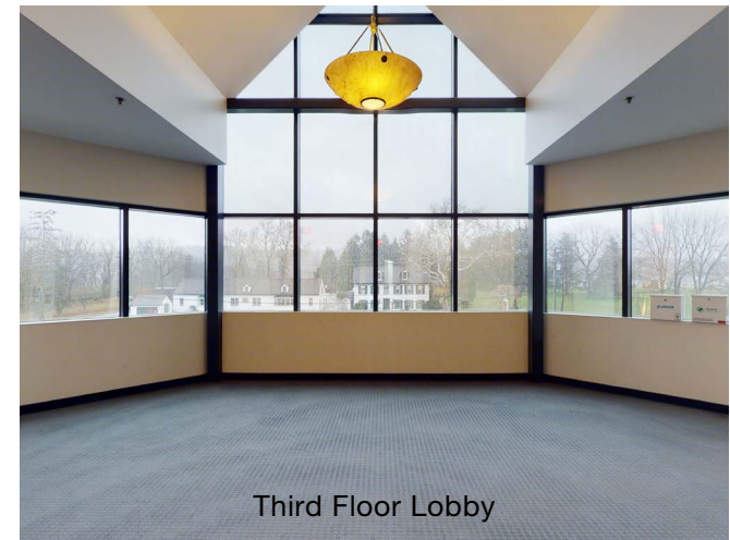
Third Floor Lobby